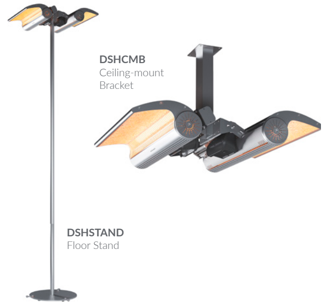
DSHCMB Ceiling-mount Bracket